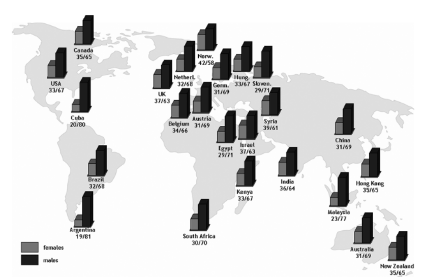
Fig. 1: Sex of the main characters in fictional programmes

14 % are presented as obvious villains. Countries with a particularly large share of antagonists are the UK (29%) and Australia (27 %); countries in which these characters appear much less often are Israel (5 %) and Belgium (6 %). Only in 10 % of the shows women are presented as antagonists; compared to 15 % of all male characters.